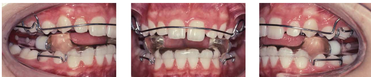
Fig 2. Incremental advancement Twin-block appliance.

20% treatment discontinuation, we recruited over 200 patients with an intention to treat analysis.