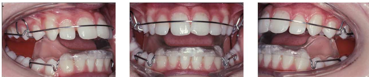
Fig 1. Standard Twin-block appliance.