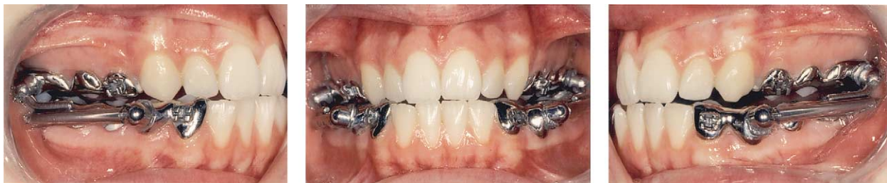
Fig 2. Design of Herbst appliance used in study.

each patient entered the study, and the final data collection (DC2) occurred when the treatment was completed. The following were collected by each orthodontist and sent to the study coordinating center: