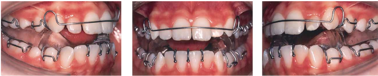
Fig 1. Design of Twin-block used in study.